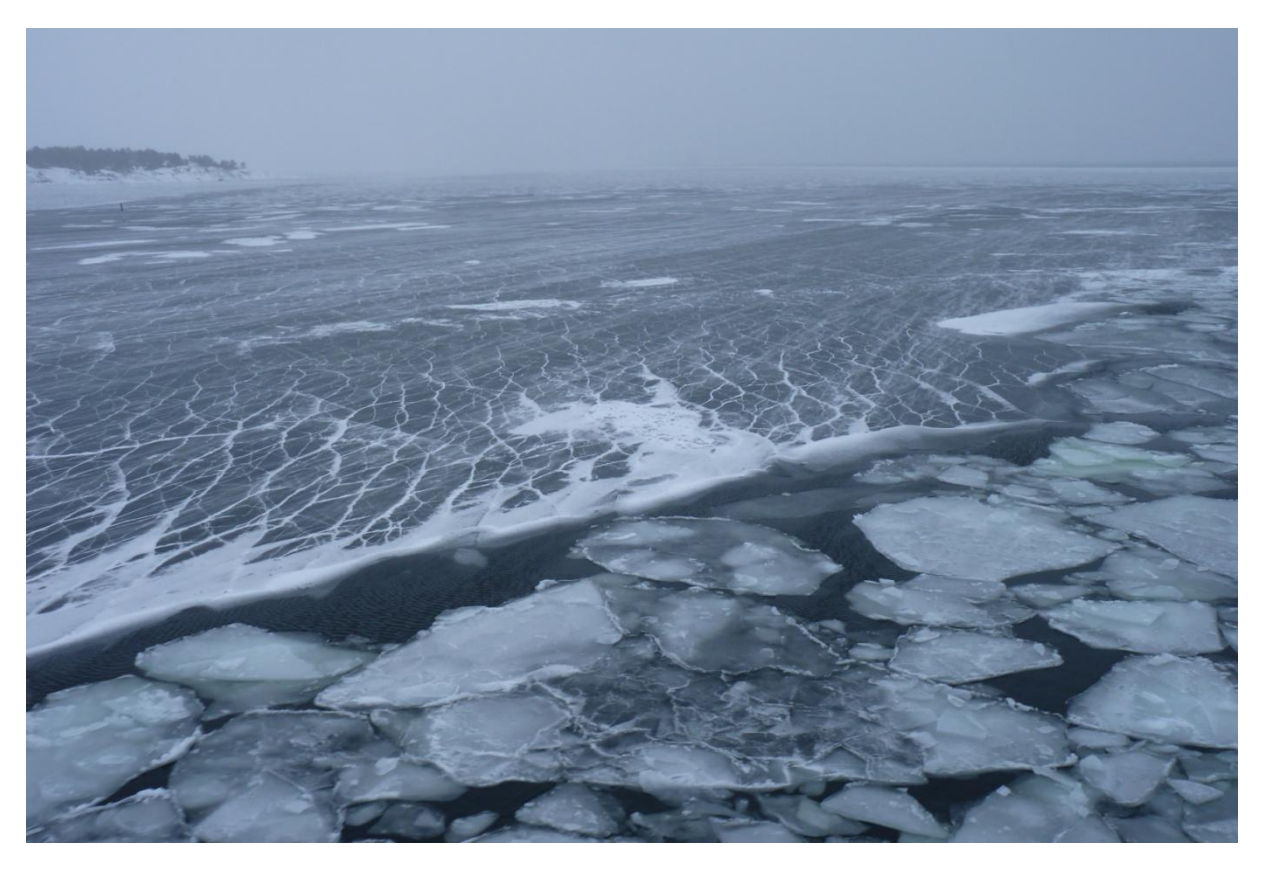
Page 16 sur 16