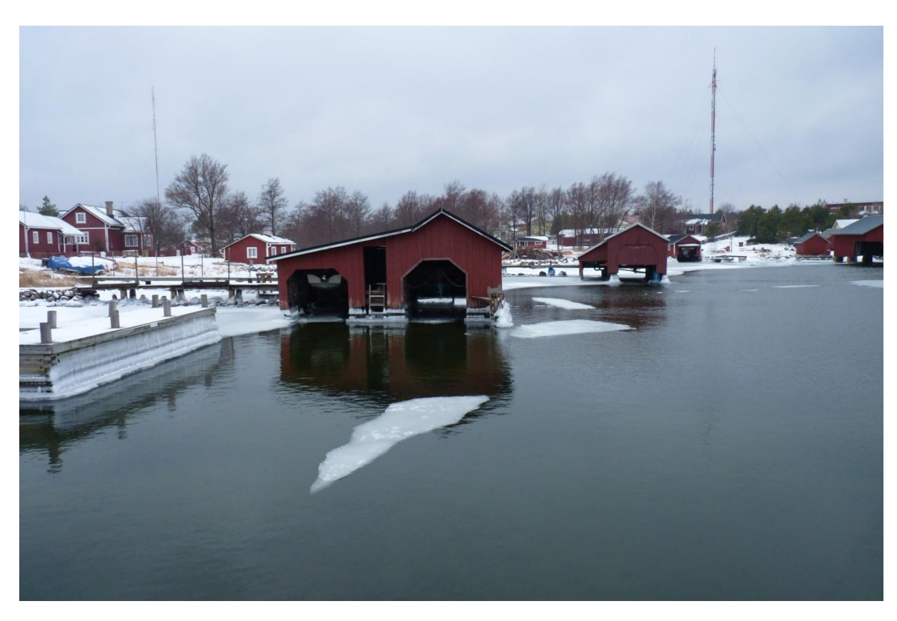
Page 15 sur 16