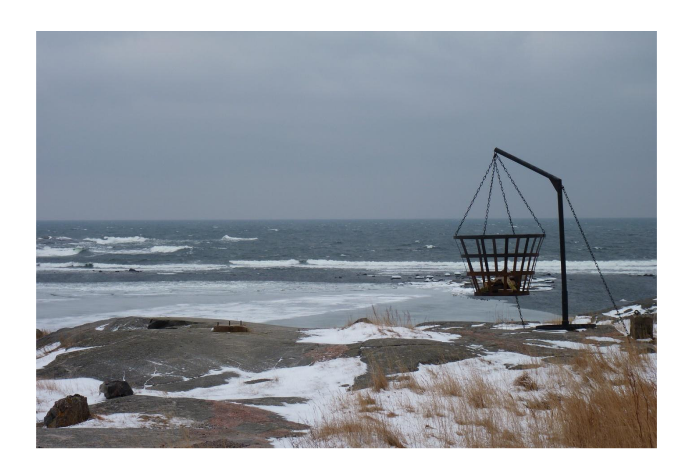
<u>Utö Impression – On the way to Utö – Hugues Dufourny</u>