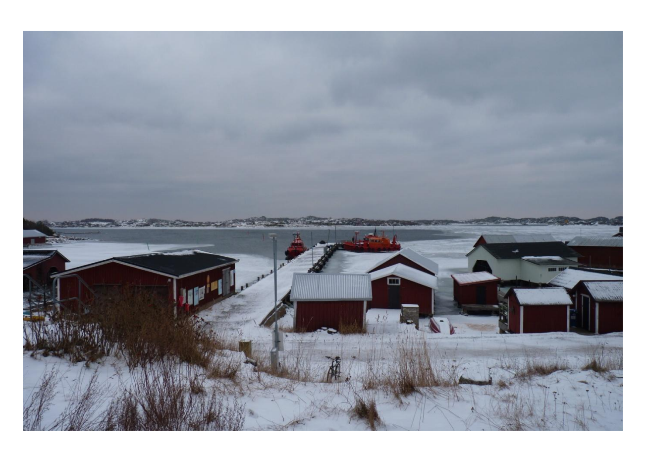
Page 14 sur 16