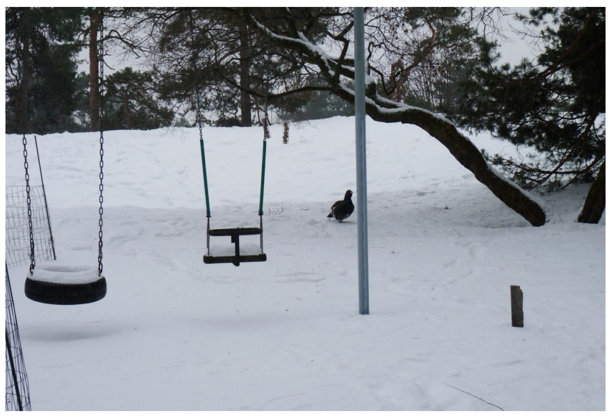
Page 6 sur 16