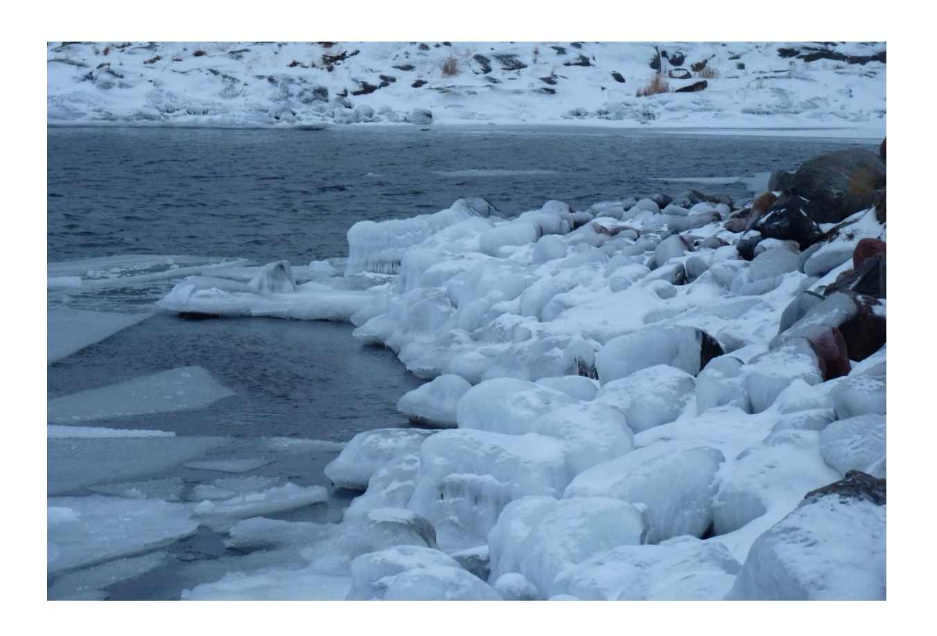
<u>Utö Impressions – Hugues Dufourny</u>