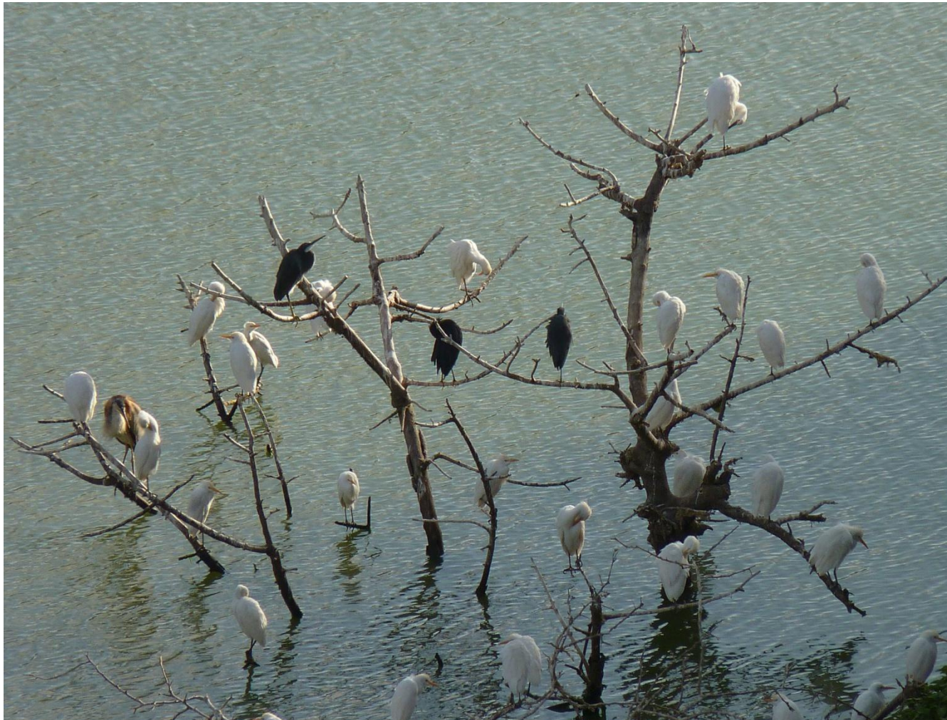
Group of herons at Barragem de Poilão including Cattle Egrets, Little Egret (1), Western Reef-Heron (2), Black Heron (1) and (Cape Verde) Purple Herons (1)